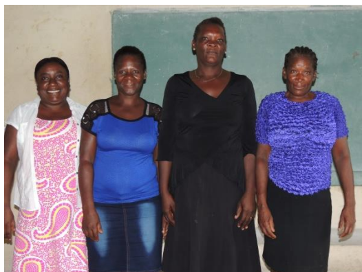
Women's Federation leaders from 4 zones

Grassroots "Women's Federation" groups are active in 7 distinct villages in the region, and Rayjon seeks to partner with them to focus future energy on economic development and women's microcredit programming, especially those that include the above areas of training that have proven effective in helping beneficiaries increase their capacity to support themselves, improve farming outcomes, and participate in the local market economy.