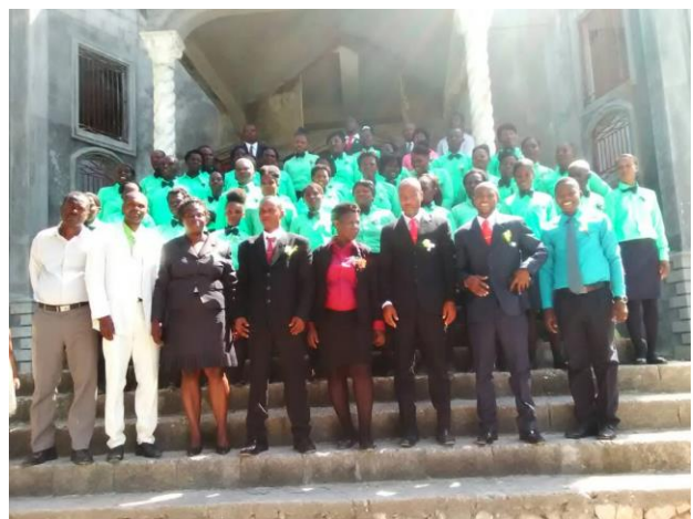
1 Alpha Graduation, 2017

The Cost: each level of the Alpha literacy programs costs about $ 5,000 (class of 25 students for one year). Rayjon hopes to continue supporting 4 communities through the full cycle (4 levels).