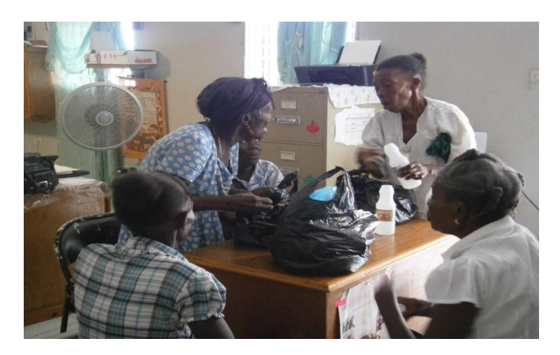
Beneficiaries of the Help Age Program

During these three months, we sent a new list of the elderly who are in need to those responsible for this program.