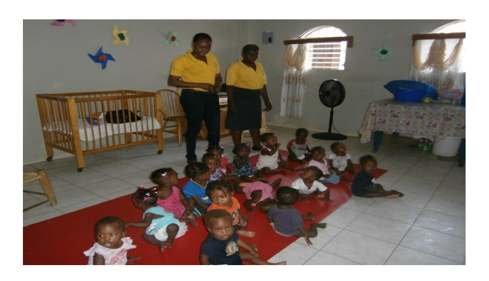
Children in the nutrition program with staff

Each time we conduct training, we find that many people participate and many changes take place among them as a result of the training.