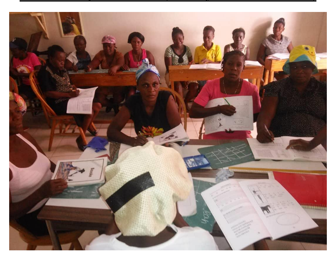
Participants from Level 1 Alpha and Post-Alpha